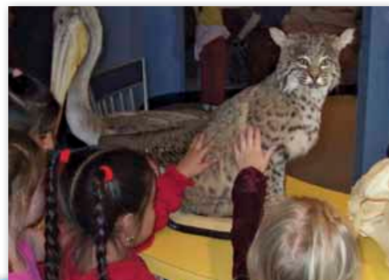
Coastal Discovery Center exhibit

Ranger-led park programs include Junior Ranger programs for children ages 7 to 12, guided hikes and campfire programs. Call (805) 927-2035 for more information.