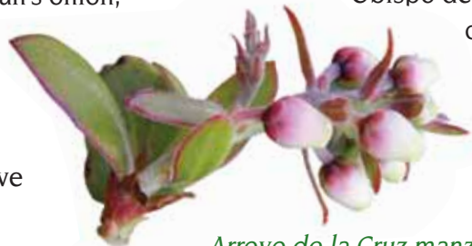
Arroyo de la Cruz manzanita

The park is home to rare and endangered plants, including maritime ceanothus, dwarf goldenstars, Arroyo de la Cruz manzanita, adobe sanicle, Hickman's onion, Blochman's dudleya and Arroyo de la Cruz mariposa lily. Prairie grasslands are among the area's native plant communities.