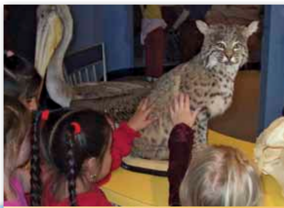
Coastal Discovery Center exhibit

Ranger-led park programs include Junior Ranger programs for children ages 7 to 12, guided hikes and campfire programs. Call (805) 927-2035 for more information.