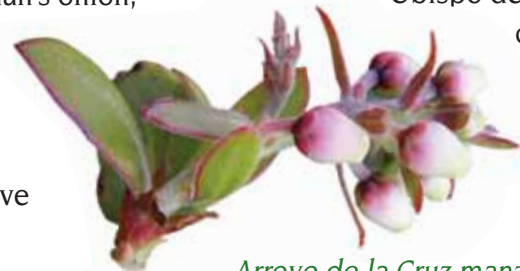
Arroyo de la Cruz manzanita

The park is home to rare and endangered plants, including maritime ceanothus, dwarf goldenstars, Arroyo de la Cruz manzanita, adobe sanicle, Hickman's onion, Blochman's dudleya and Arroyo de la Cruz mariposa lily. Prairie grasslands are among the area's native plant communities.