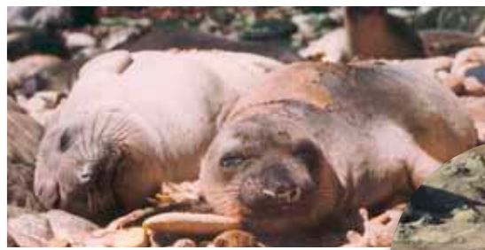
Young elephant seals napping At right: adult male elephant seal